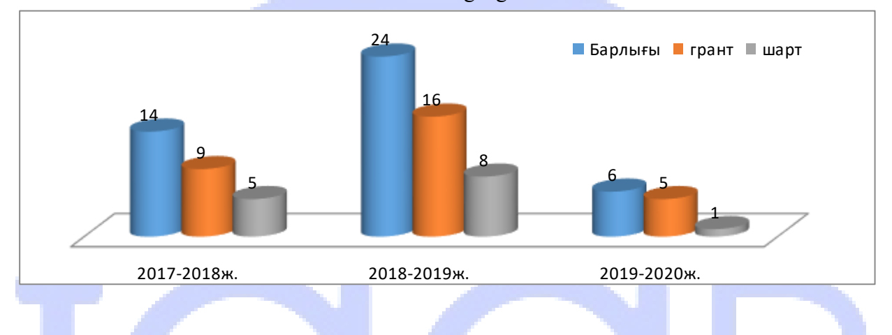
Dynamics of the contingent of master students for the last 3 years in the specialty 7M01711 - "Kazakh language and literature»

The University provides for certain control mechanisms of the process of adaptation of students and trainees: is adaptation week, familiarization with the rules of stay in the University, credit and technology training, point-rating system of education, the work of structural units, rules, dormitories, honor student, etc.