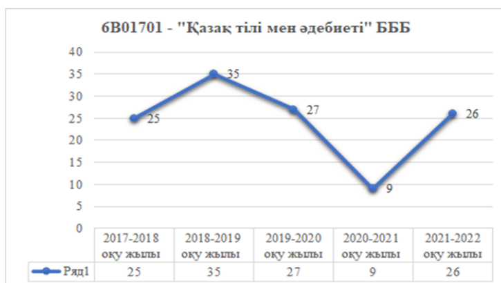
Contingent of EP 6B01701 Kazakh Language and Literature

You can see an increase in the number of master's degree students in the indicator for 2017-2022 for the EP 7M01701 Kazakh language and literature in recent years. It can be seen that the choice of undergraduates of the university had a significant positive impact on the dynamics of the number of students in the specialty: