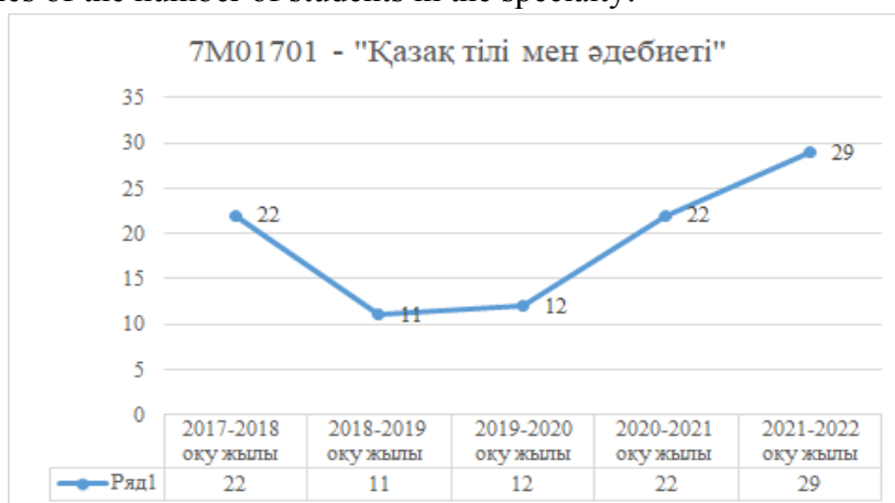
Contingent of EP 7M01701 Kazakh Language and Literature

You can see an increase in the number of master's degree students in the indicator for 2017-2022 for the EP 7M01701 Kazakh language and literature in recent years. It can be seen that the choice of undergraduates of the university had a significant positive impact on the dynamics of the number of students in the specialty: